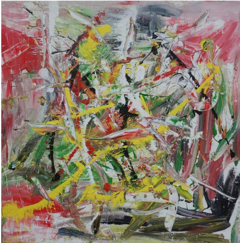
"Howzit Brah", 2022, acrylic, 40 ½ inches x 40 ½ inches