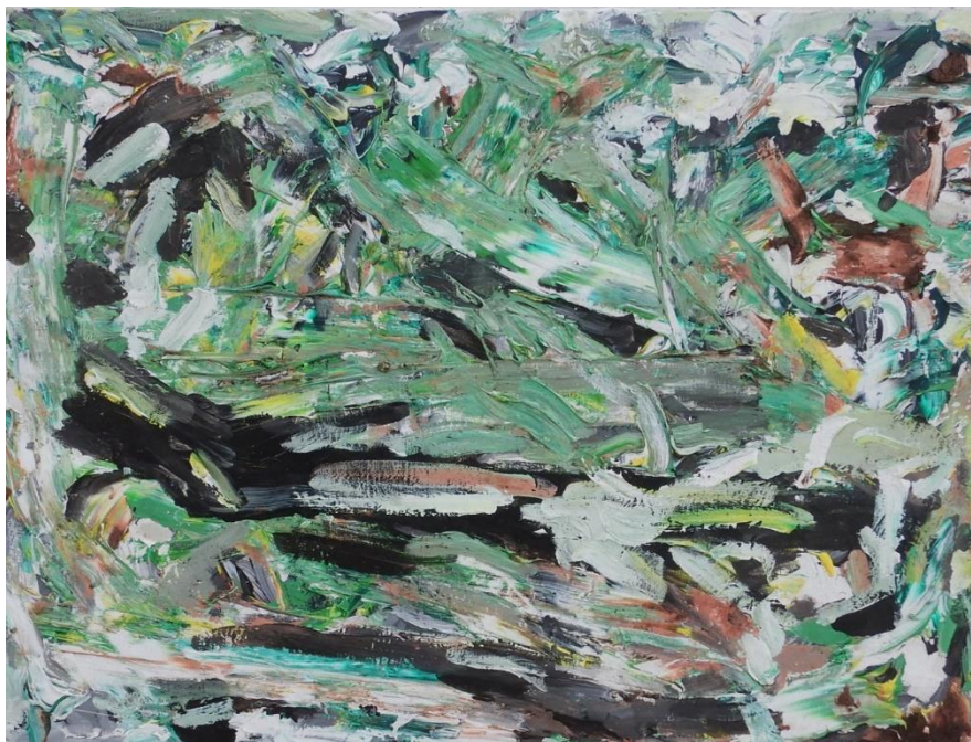
"Kalopa", 2022, acrylic, 23 3 / 4 inches x 17 inches