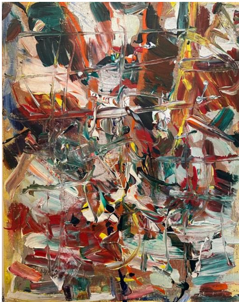
"Piano" 2022, acrylic, 20 inches x 16 inches